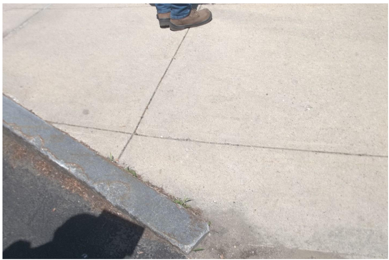
The ADA Team determined that the curb cut to the sidewalk that leads to the accessible entrance to the Library from the parking lot needs repair or patching. We recommend that the curb cut be repaired to improve the accessibility to the Groton Public Library's accessible entrance. An example of such a tactile warning is included with this report.